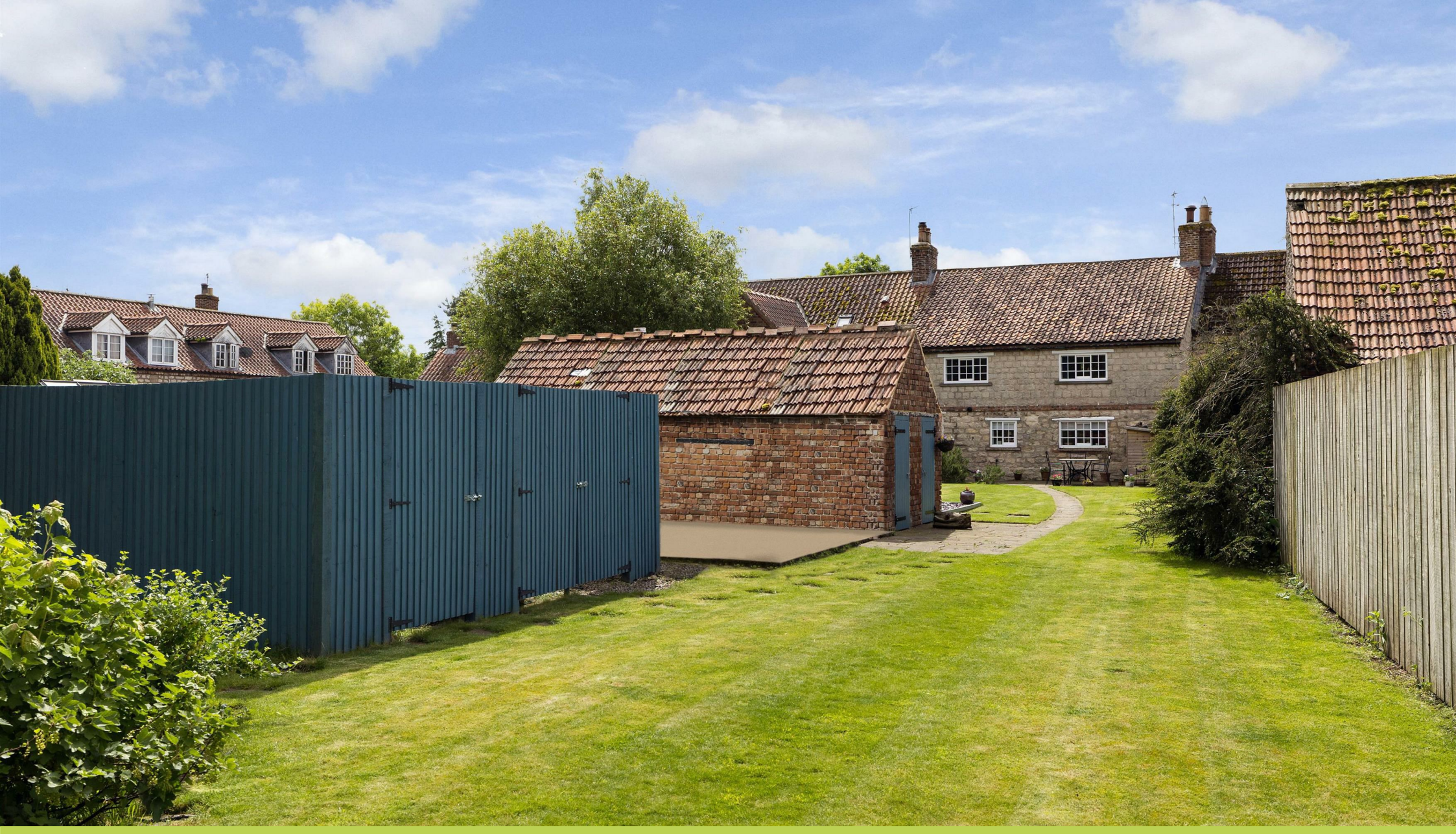
Plum Tree Cottage, 2 Town Street | Settrington, Malton